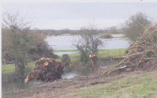
Rivers Churn & Thames Enhancement North Meadow, Cricklade www.waterpark.org